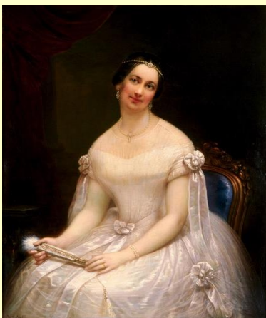
Julia Gardiner Tyler